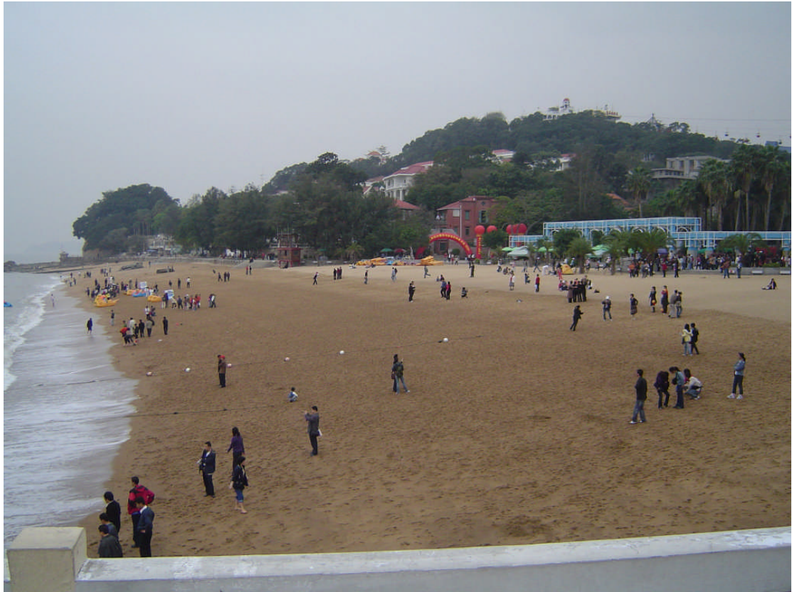
Main Bathing Reserve Gulangyu