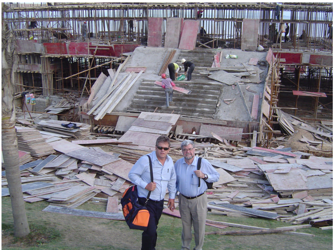
Works well under way at Training Centre Xiamen