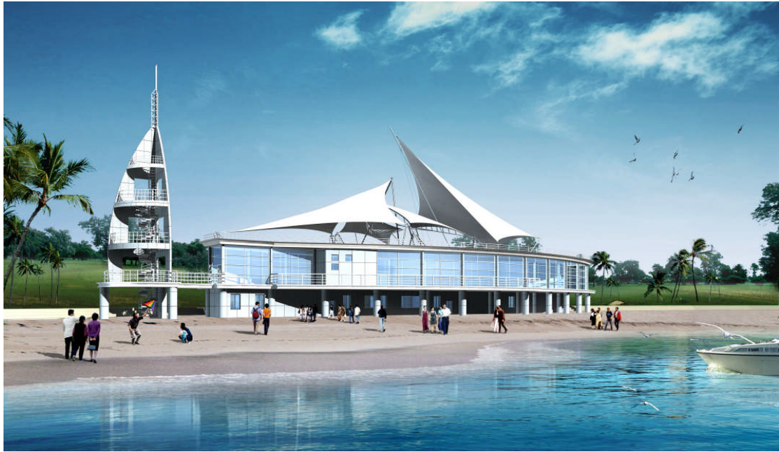
Artists impression of New Xiamen RLSS Headquarters