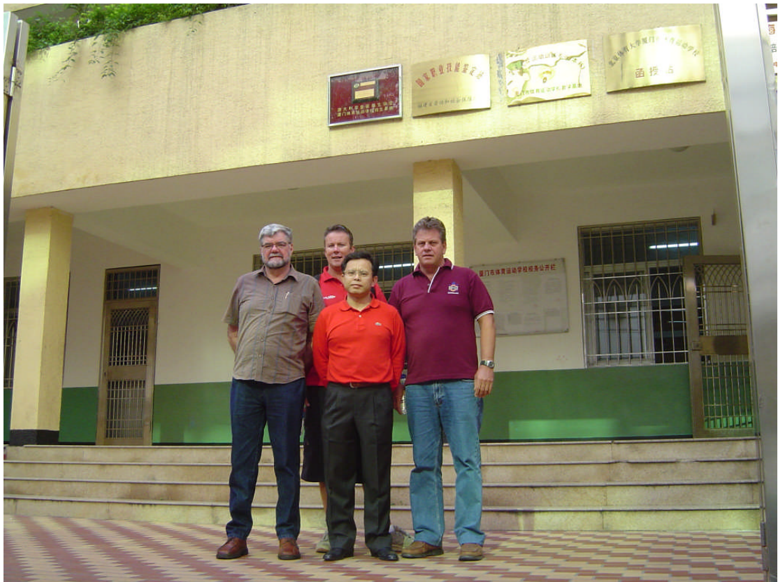
Delegation at Xiamen Sports Academy Aquatic Facility