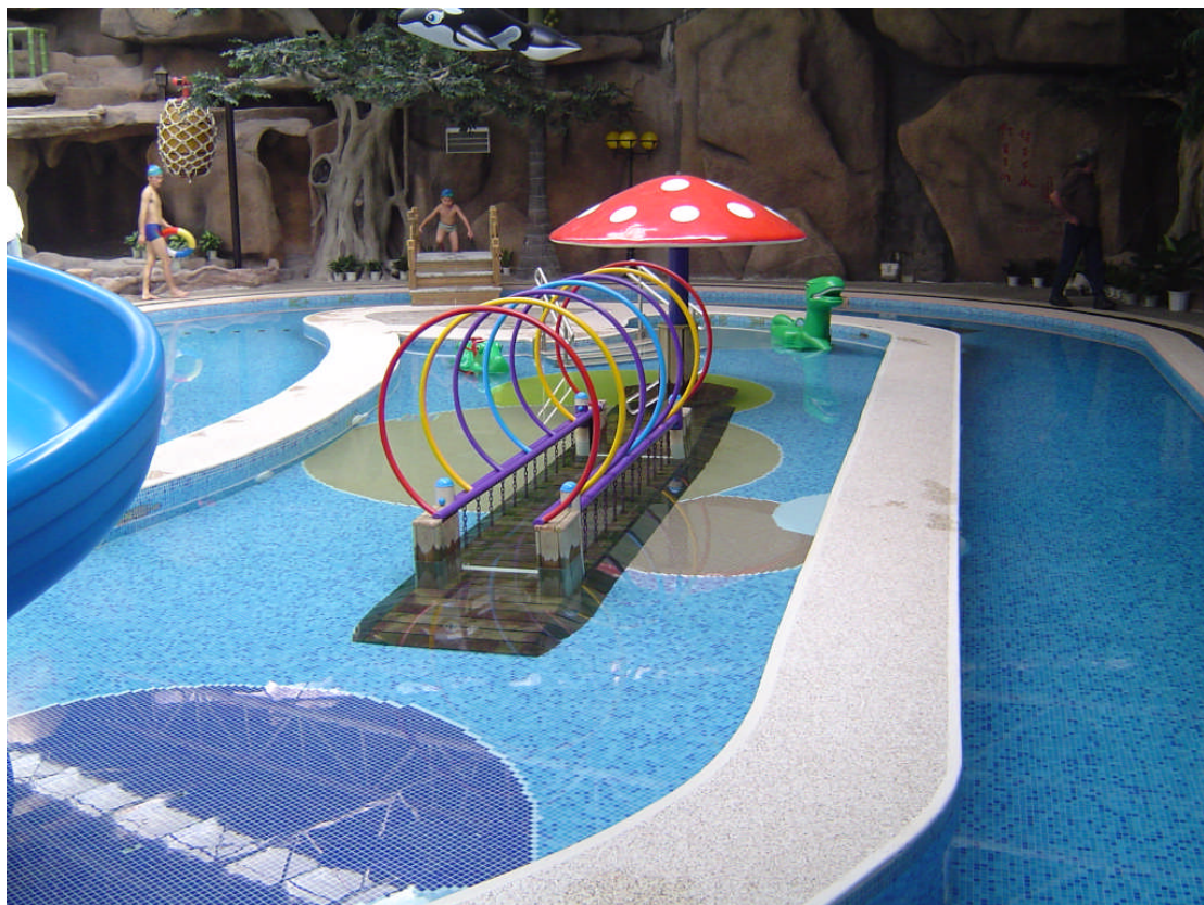
Children's water feature Hilltop Health Spa

An interesting concept that was displayed both at Hillford and at the Xiamen Sports Academy Pool was the current testing levels and readings for the pools, PH, Chlorine, and Water Temperature.