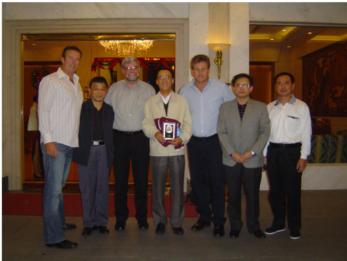
Farewell dinner and presentation of gifts.